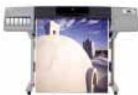
hp designjet 5500 printer (42-inch series)